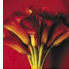
Rachel LaCour Niesen

10 wedding stories atlanta sisters plan big day together